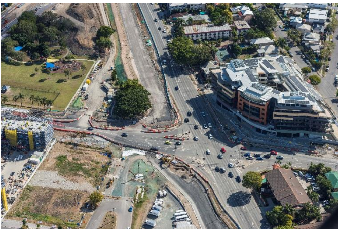
The KSD/Nudgee/Remora intersection looking east to west

Get behind the barriers and check out the latest progress on the Kingsford Smith Drive upgrade with the new photo gallery on our website, www.ksdupgrade.com.au