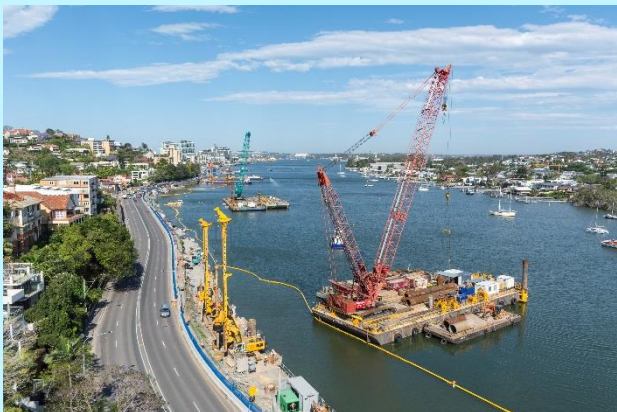
Marine construction area looking east

Visit www.ksdupgrade.com.au/the-project/gallery to see the latest progress on the project.