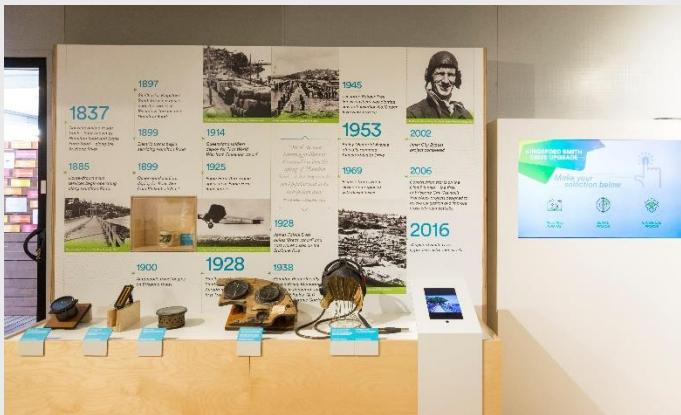
Artefacts and historical photos in the main Visitor Centre

The main Visitor Centre is located at the project site office at 605 Kingsford Smith Drive and is open Monday to Friday 7:30am to 4:30pm, or at other times by appointment.