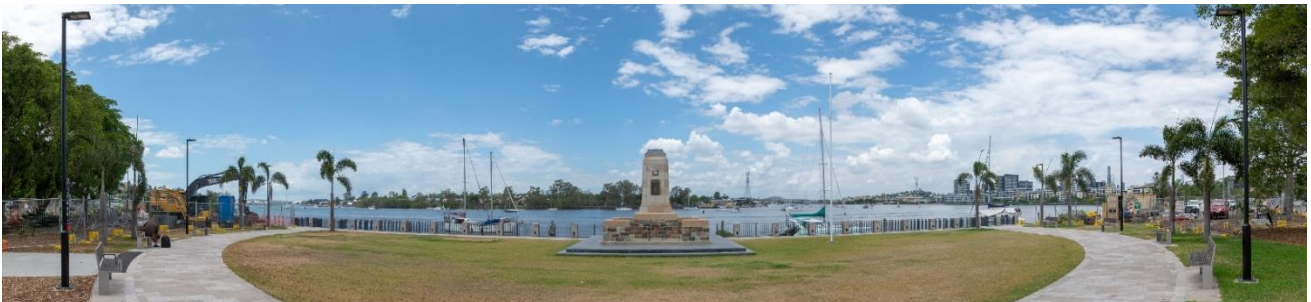
Cameron Rocks Reserve will be open for the ANZAC Day dawn service on 25 April 2019.

All construction work east of Harbour Road is expected to be completed in mid-2019, at which point this section of Kingsford Smith Drive will open to three lanes of traffic in each direction.