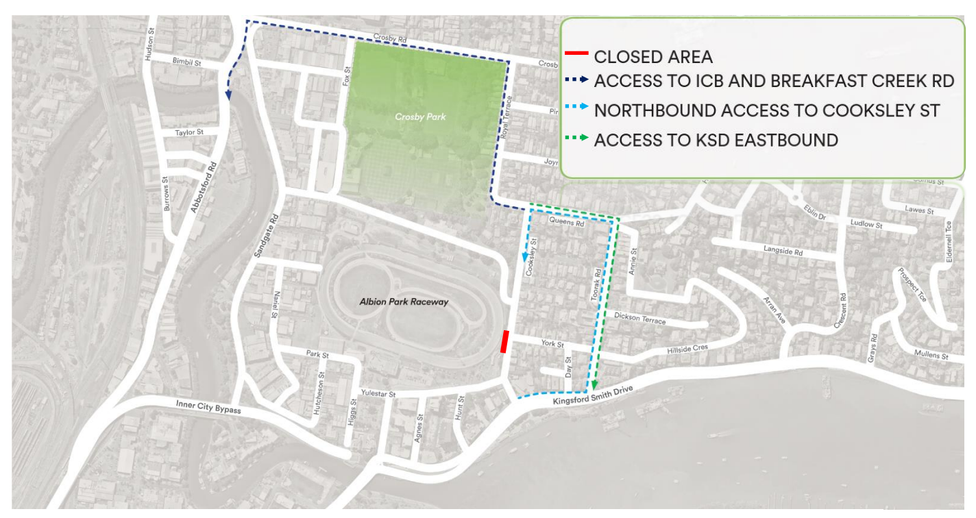
Cooksley Street weekend closure: 7pm Friday 3 November to 5am Monday 6 November 2017